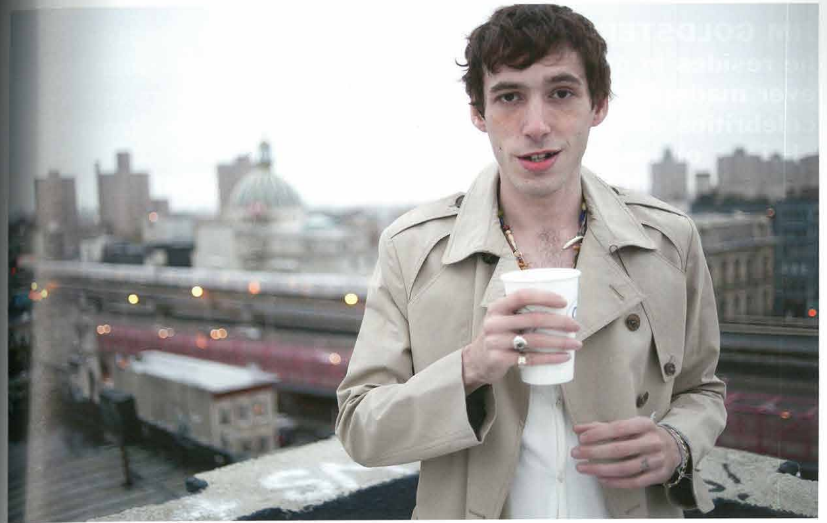
White cotton waistcoat MAISON MARTIN MARGIELA and trench coat DIOR HOMME Opposite page: Vintage leather jacket and Donald's own clothes